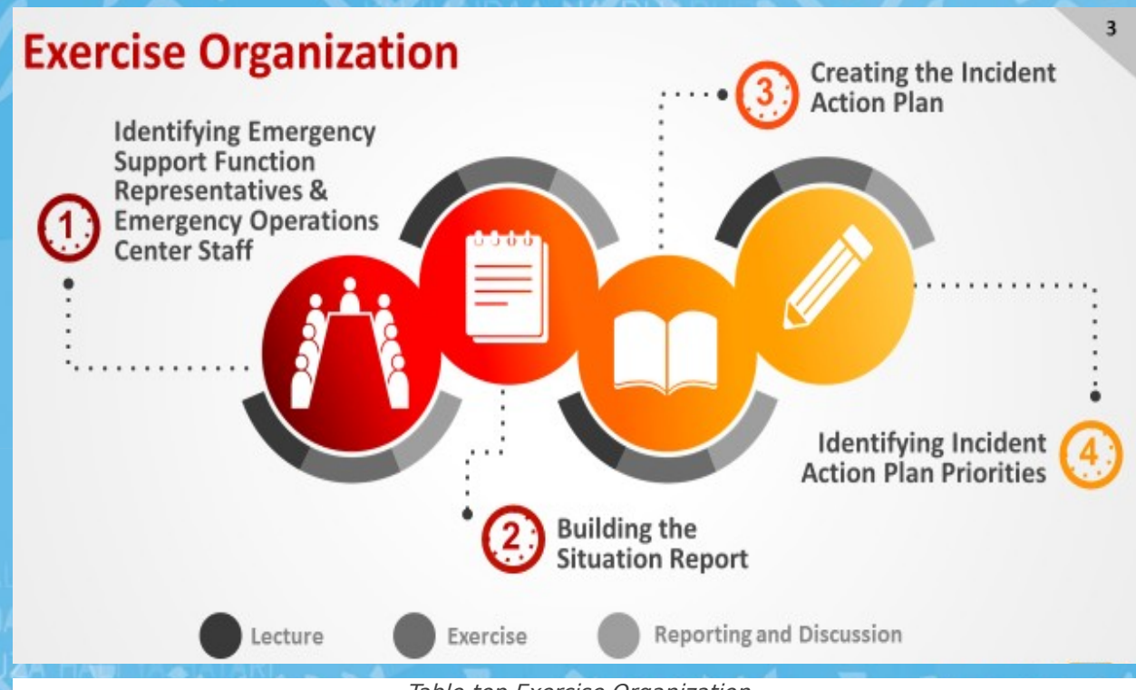
Table-top Exercise Organization